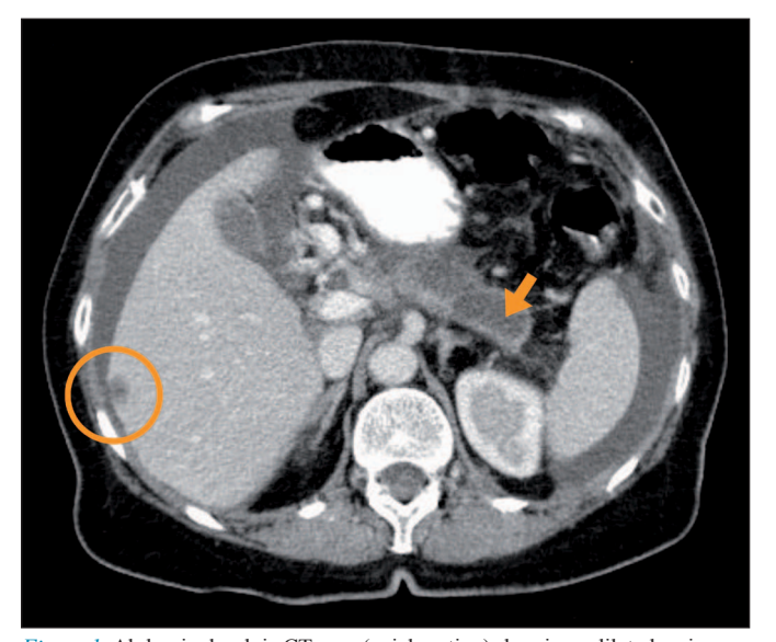
Figure 1. Abdominal-pelvic CT scan (axial section) showing a dilated main pancreatic duct that it is occupied by a hypodense tissue structure (orange arrow) – suspected of IPMN involving the main duct – and a hepatic nodule in the right lobe (orange circle) suggestive of secondary lesion.

Due to later development of recurrent abdominal pain in the upper quadrants, persistent nausea and occasional vomiting for one month, she underwent digestive endoscopy and abdominal-pelvic computed tomography (CT). The esophagogastroduodenoscopy showed grade C esophagitis and congestive gastropathy with histological signs of active chronic gastritis and atrophy at antral mu-